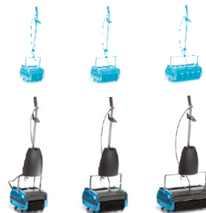
R20 / R20T R30 / R30T R45 / R45T