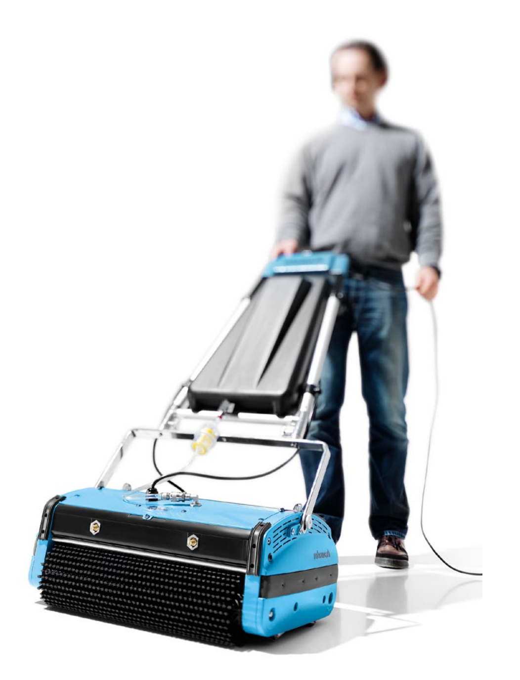
Rotowash One machine for multiple applications